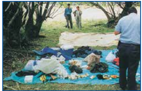
All of this equipment was stowed in the rear baggage compartment of the crashed aircraft (shown left).

The effects above show how the total performance of the aircraft is affected. These factors become crucial in the critical flight phases of takeoff and landing.