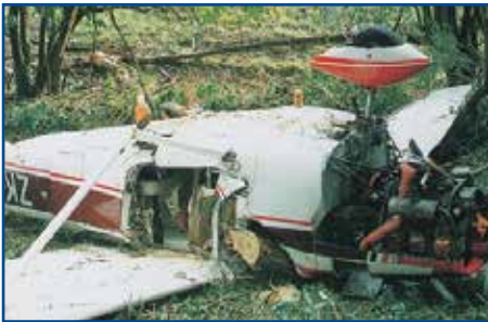
This Cessna 172 failed to clear trees at the end of the aerodrome. It was loaded with full fuel, four people and the baggage shown right.

Manufacturers conduct extensive flight tests to establish loading limits for their aircraft because they are critical for safe flight. It is important that you adhere to these limits when loading your aircraft.